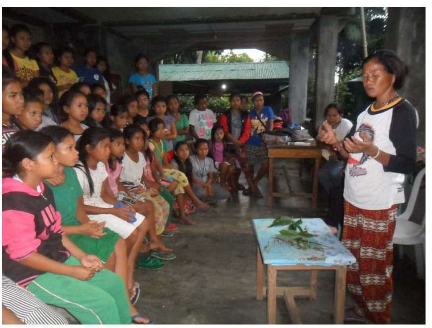
(Class regarding health, nutrition and herbal preparations)