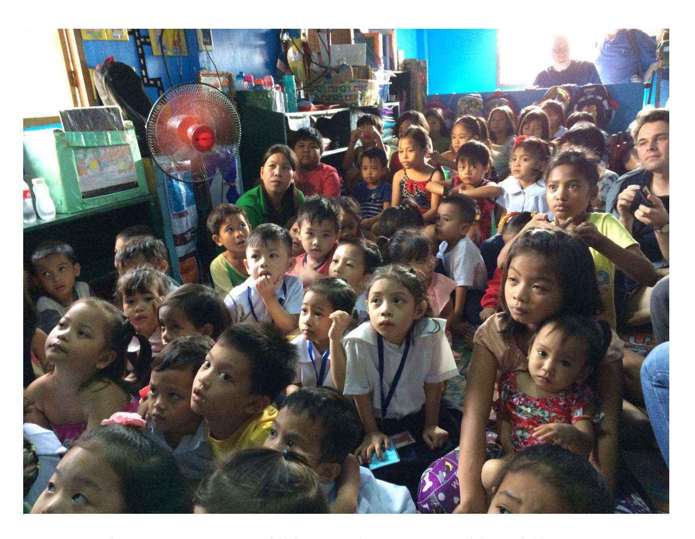
In Santo Niño TNK center, 70 children aged 0 to 6 years old are daily beneficiaries.

At the start of school year 2017-2018, 54 children were enrolled in early childhood education in the TNK Daycare center. Pre-schooling classes and tutorial services are offered to children on a daily basis. The main objective is to prepare children for formal schooling.