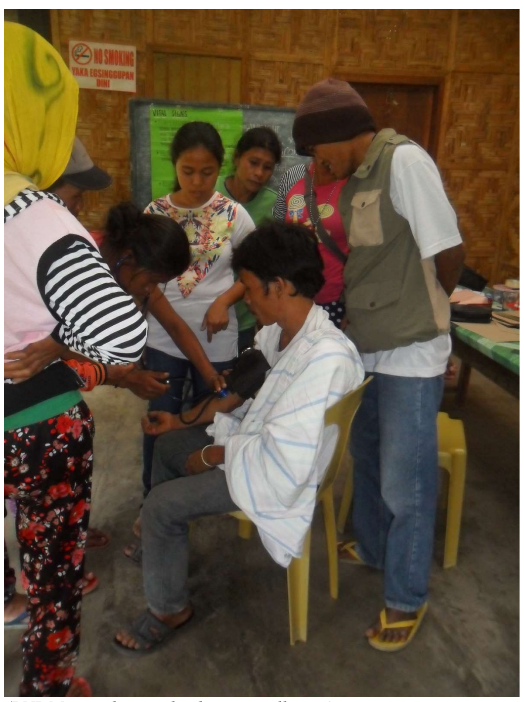
(RNDM providing medical care to villagers)