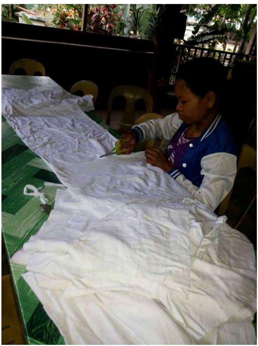
(RNDM skills training)

vehicle through the local government because it was a Sunday. So they came to Delesan Kailawan to ask for help. RNDM assisted them by providing their transportation needs. They were attended to in the Provincial Hospital and the child was given medical care. According to the grandmother, the child was diagnosed with Leukemia. He was discharged after a week and came back to the center to ask help because the teenage mother was not well and the child cannot breastfeed. We accepted him to be one of our Nutrition beneficiaries. Now, the child looks healthier and has slowly gained color.