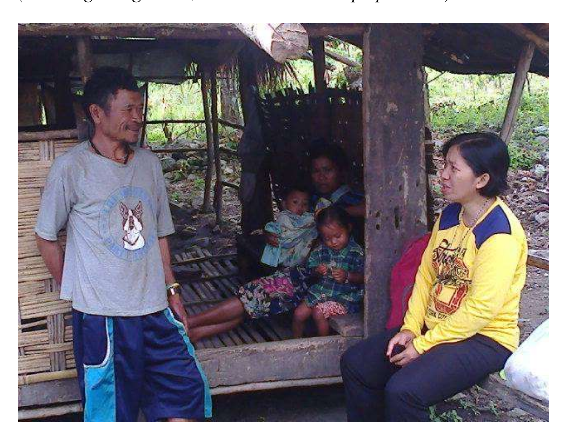
(RNDM sister visiting families in the village)