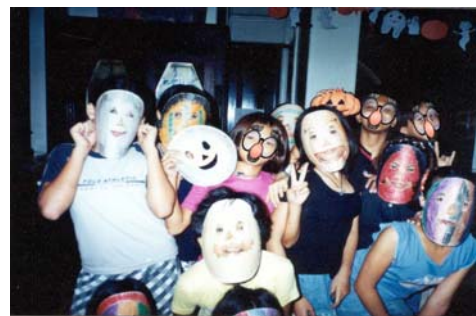
The girls having fun