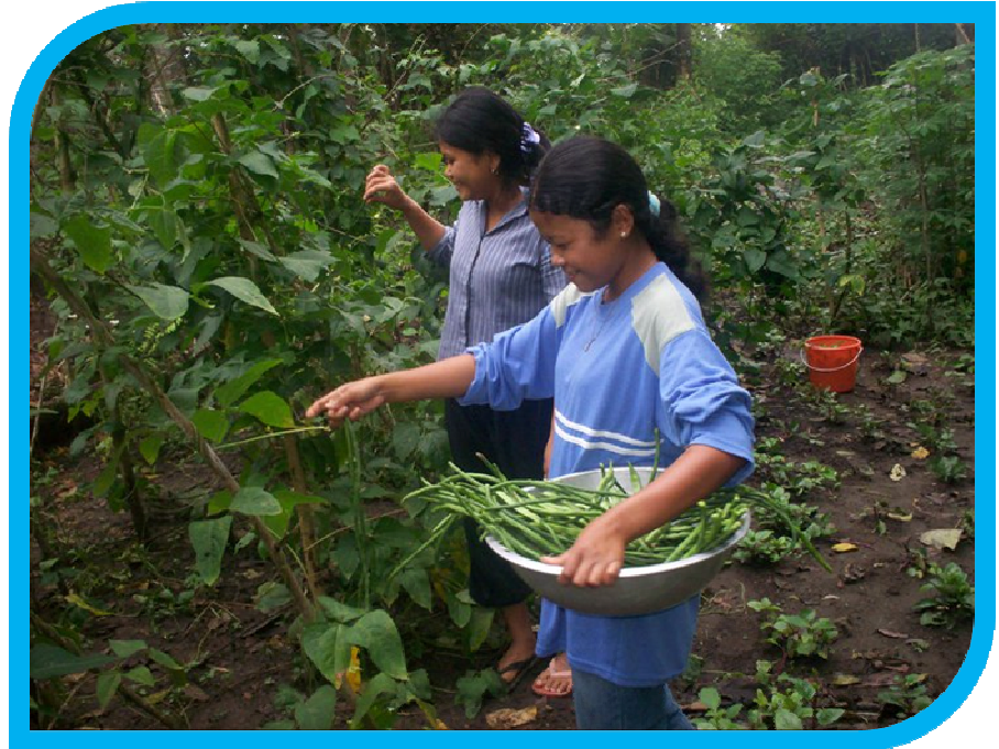
Agricultural Project, Kulaman, Cotabato, Southern Philippines

Health education classes are also conducted each afternoon in the dormitory of Dalesan Kailawan. Fifty-five