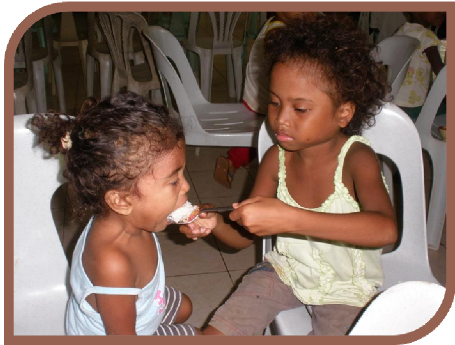
A Helping Hand, FOLPMI Feeding Center

These feeding centers are usually held in available small make-shift community rooms. Most often the foundation's Day Care centers are used as a Feeding Centers when classes are done. Barangay halls in the depressed communities are also used as Feeding