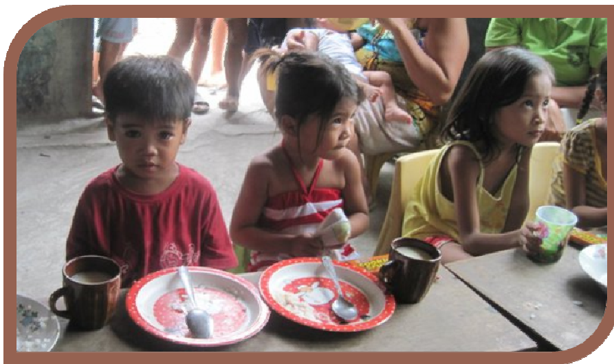
Full stomachs and empty plates, FOLPMI Feeding Center

feeding centers purchasing and preparing the food, setting the table, and literally feeding children unable to feed themselves. For Sitio Wawa, the children ranged in age from 1 to 5 years old. Before the start of the feeding program, all children are provided with