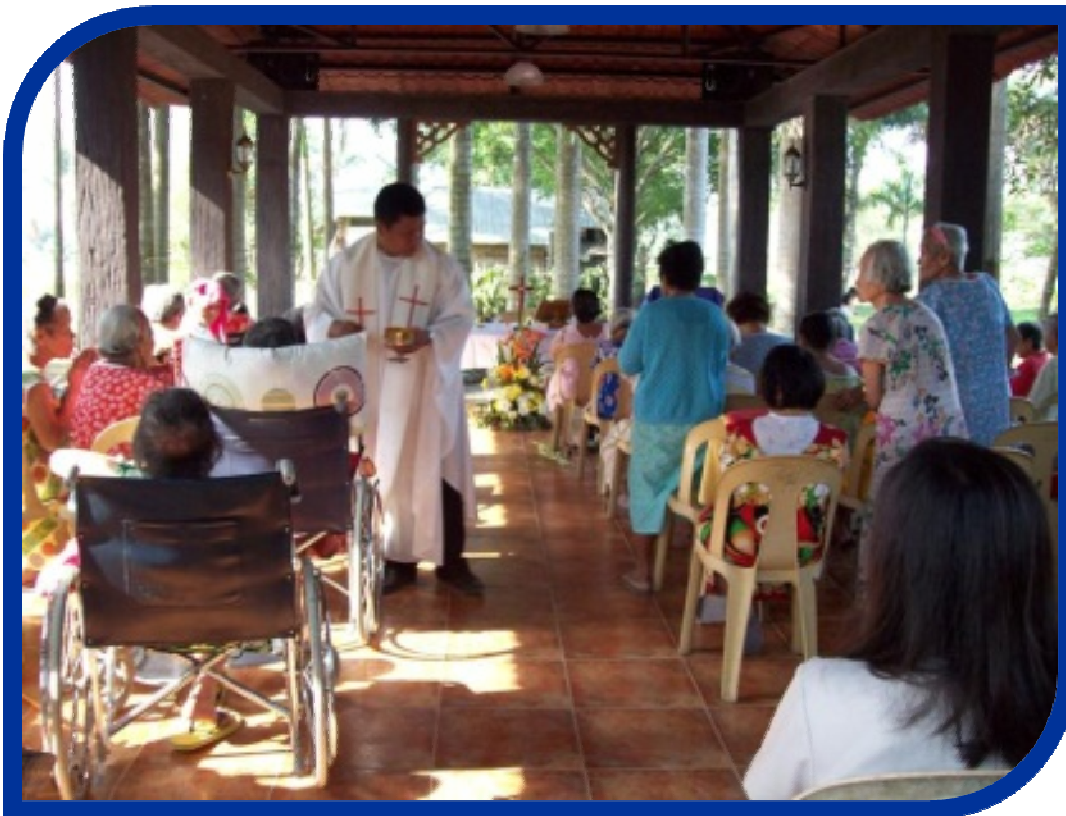
Distributing the Holy Eucharist at ANAWIM Residents