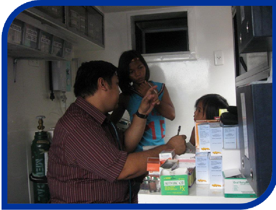
Chaps Mobile Health Clinic, Manila, Philippines

Putting health as a primary valuable concern, they continuously consult the physician to make sure that they are healthy to pursue their various daily activities. This is the most important impact of the clinic's presence in the areas, along with our sessions in primary health care.