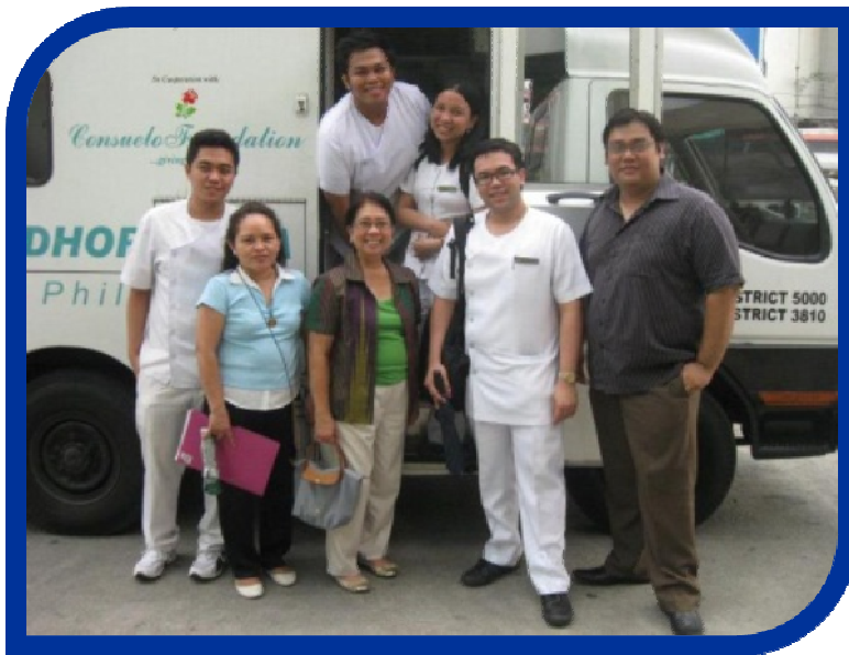
CHAPS Mobile Health Clinic, Manila, Philippines

In 2011, the Mobile Health Clinic (MHC) Project attended or managed a total of 3,738 medical and dental consultations. These consultations benefited 1,402 individuals. The direct beneficiaries comprise about 89.7% of the total 1,297 children under ChildHope Asia Philippines' care. The top five treated ailments are as follows: (1) Bacterial Respiratory Tract Illness, (2) Viral Respiratory Tract Illness, (3) Dental Caries, (4) Hyperactive Airways Syndrome, and (5) Allergic Rhinitis.